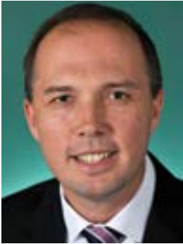
DUTTON, the Hon. Peter Craig Member for Dickson (Qld) Liberal Party of Australia