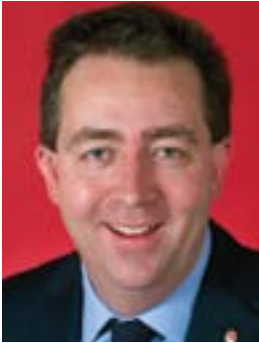
McGRATH, James Senator for Queensland Liberal Party of Australia