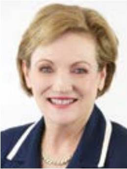
PRENTICE, Jane Member for Ryan (Qld) Liberal Party of Australia